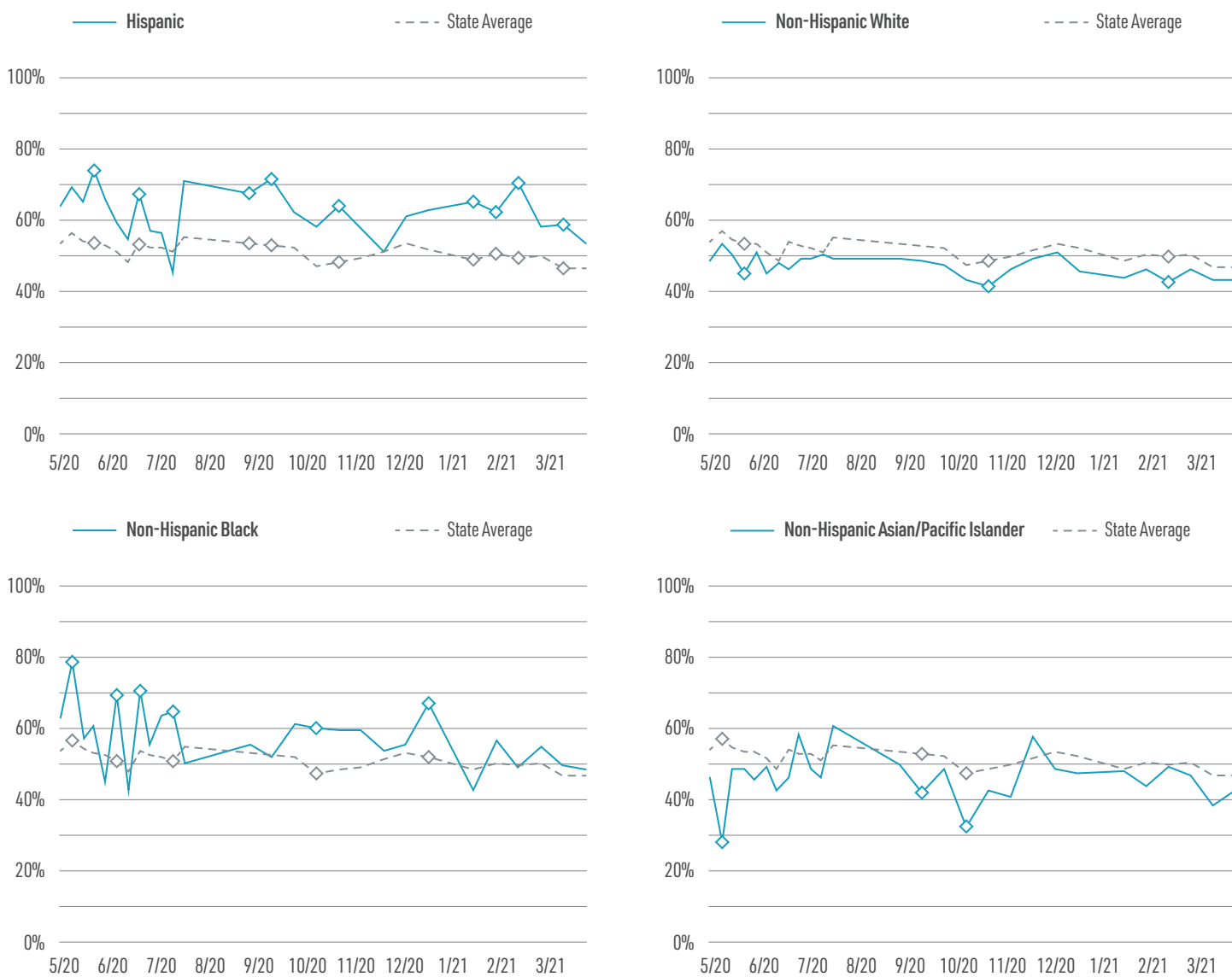
Figure 2: Difference in Work Loss Compared to Average, by Week and Race/Ethnicity